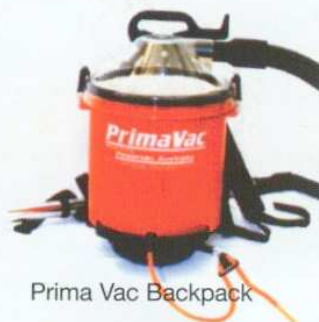
Prima Vac Backpack