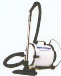
Mighty Midget Pull Along