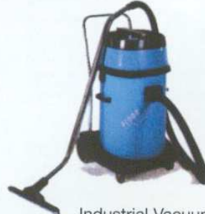
Industrial Vacuums 15 - 80 litre

Ph: 08 9242 4751 Email: powervac@eon.net.au Web: www.powervac.biz