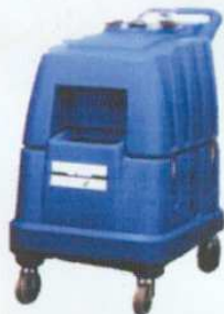
Portable Carpet Extraction 15 - 80 litre

Ph: 08 9242 4751 Email: powervac@eon.net.au Web: www.powervac.biz